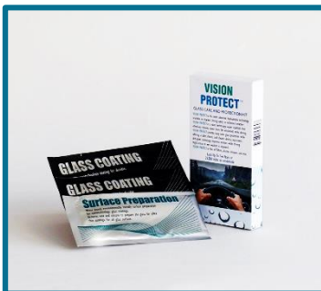
Vision Protect Individual Windshield Kit Sold Individually or in Case of 30 and 50