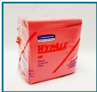
Lint Free Towel 26 per Pack