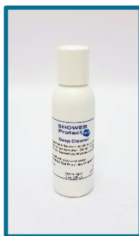
Glass Deep Cleaner 2oz Bottle