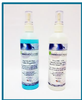
CL 50 & NG 1010 12oz Bottle