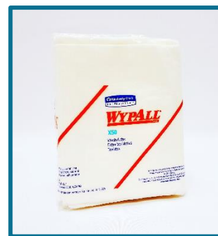
Lint Free Towel 26 per Pack