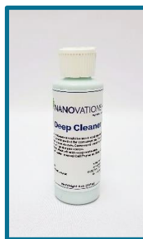
Glass Deep Cleaner 4oz Bottle